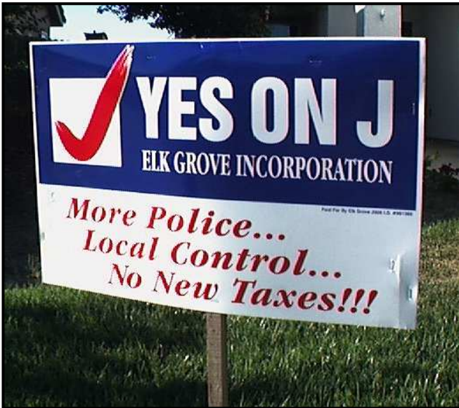
A strong design for local control and improved police protection was expressed during the incorporation campaign.

Elk Grove's incorporation and the creation of this General Plan represent the product of years of work on the part of residents and businesses in the community who saw the need for local control over the decisions which affected the quality of life in Elk Grove. The "Yes on J" campaign, which led to the successful vote for incorporation in March 2000, stressed increased law enforcement presence and local control.