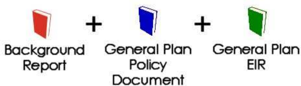
This General Plan is arranged in three volumes, which combine to form the entire General Plan

The organization of the General Plan in these three volumes (Background Report, Policy Document, and EIR) is illustrated below. Together, these documents comprise the Elk Grove General Plan.