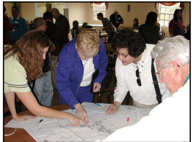
Participants at one of three Visioning Workshops held in 2001

Citizen participation played an important role in preparing the Elk Grove General Plan. Because the General Plan needs to reflect community goals and aspirations, citizens were involved with issues identification and goal formulation. The public and various civic and professional organizations were consulted during the Plan preparation stage whenever possible. Numerous public meetings were held to discuss the Plan, and additional public involvement occurred during the public hearing process. Highlights of this process included three Visioning meetings, held in October and November 2001, at which participants used maps and written comments to define their vision for the future of Elk Grove.