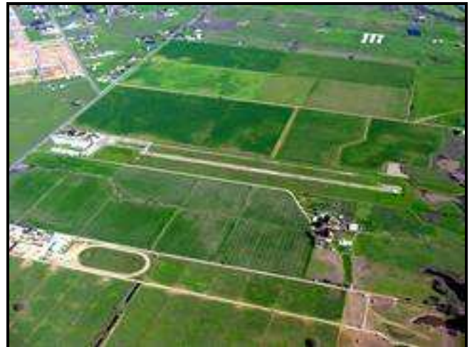
Aerial photo of Elk Grove Airport. Grant Line Road is at the upper left in this photo; view is to the northeast.

Although no airports exist within the current (2004) city limits, two general aviation airports exist in the planning area: Elk Grove Airport and Franklin Field.