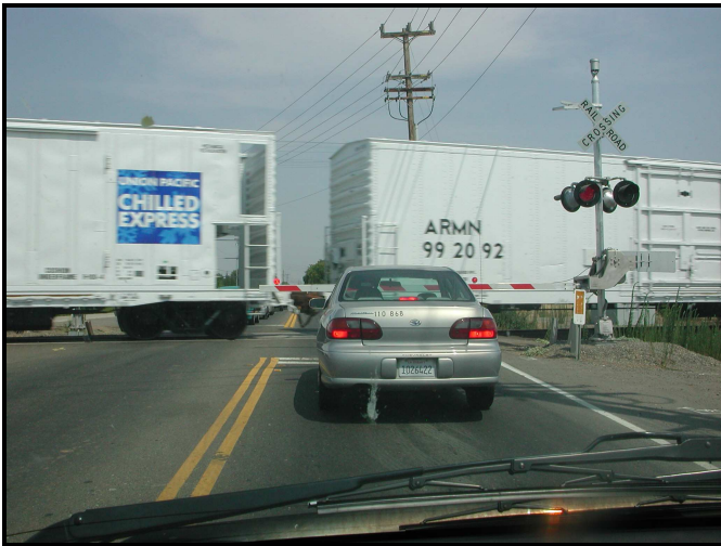
Most major east-west roadways in Elk Grove have at-grade crossings with the railways that traverse the city. Traffic backups at the crossings can be substantial.