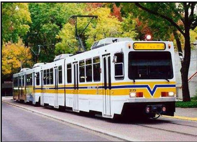
Light rail train service is proposed to be extended into Elk Grove in the near future

Light rail has operated in the Sacramento region since 1987. The system has expanded since then, and is currently planned to be extended into Elk Grove in the near future.