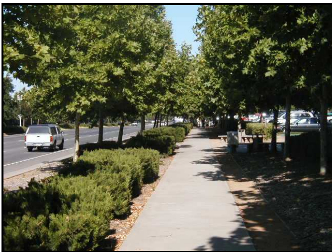
Bike paths and sidewalks form an important part of the city's transportation system, although cars are the most common form of transport

All of these forms of transportation are part of the overall circulation system; because motor vehicle traffic plays a major role in the creation of air pollution, which affects Elk Grove and the region, those modes of transport and movement which reduce reliance on motor vehicles are also part of the City's efforts to improve local and regional air quality. Please see the Conservation/Air Quality Element for additional discussion of air quality goals, policies, and actions.