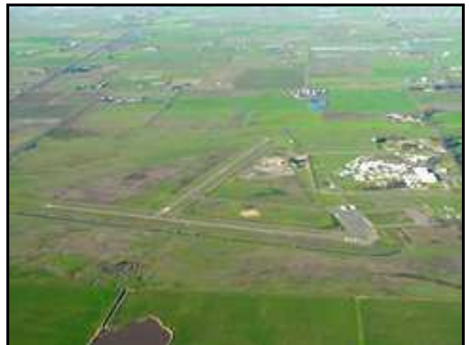
Franklin Field is located approximately 5 miles south of Elk Grove, adjacent to the Sheriff's detention facility.

Although these airports are not located in Elk Grove, they affect land uses within the city (see the Background Report for more information on safety zones surrounding these facilities), and they provide an opportunity for general aviation uses near the city.