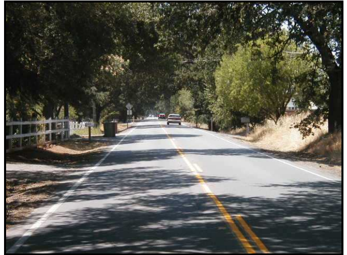
Oaks and other trees form a shaded canopy over a portion of Sheldon Road in the rural area of Elk Grove.

Mature trees—both native oaks and other native and non-native species—form an important part of Elk Grove's aesthetic, open space, and historical heritage. Because they provide relief from the primarily flat terrain of the city, as well as shade, shelter for animals and other plants, and ties to the area's historical past, mature trees are viewed as an important resource to be protected and conserved. Trees also provide other benefits, including improvements in water quality, shade for buildings, and reduction in pollution, which also justify their protection as a resource.