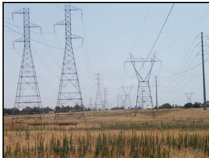
Electrical distribution facilities in Elk Grove

Energy supplies (electricity and natural gas) are supplied to the city by the Sacramento Municipal Utility District (SMUD); details regarding energy supplies are provided in the General Plan Background Report . An additional major source of energy supplies in the Planning Area is Suburban Propane, which maintains a distribution facility in Elk Grove on Grant Line Road near State Route 99.