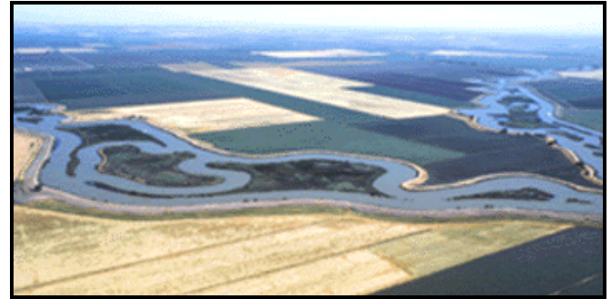
The Sacramento River Delta

Although not within the current incorporated boundaries of Elk Grove, a portion of the Sacramento River Delta is inside the larger Planning Area of the General Plan (please see the Introduction for a description and map of the Planning Area ). Therefore, the City’s long-term land use policies will require coordination with the Delta Protection Commission (a state agency) once these lands are included within the corporate boundary of Elk Grove.