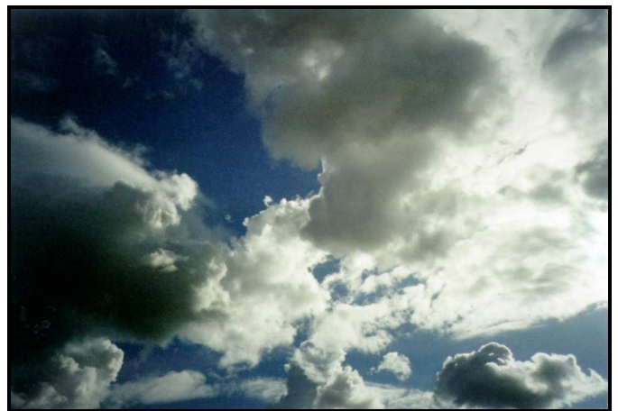
Regional air quality frequently does not meet state and federal standards, but the City of Elk Grove seeks to help achieve improvements in air quality

Air quality in the Sacramento region is, unfortunately, among the worst in the United States. A combination of poor air circulation, high summertime temperatures, and numerous sources of pollution both locally and at distant locations combine to create air pollution which frequently exceeds state and federal standards. (For more information on current air quality, please see the General Plan Background Report.)