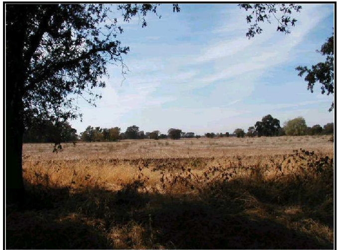
Farming remains a part of Elk Grove, but has been in decline and is not expected to be as dominant in the future.

Agriculture has historically been an important part of Elk Grove's land use and economy. Soils within Elk Grove are capable of supporting a number of crops, many of which are still grown (please see the General Plan Background Report for further information on soils within Elk Grove and the Planning Area).