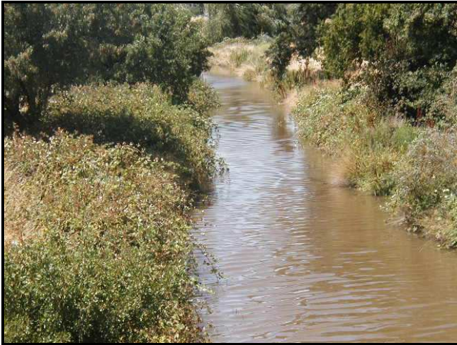
Elk Grove's creeks provide important habitat for many native plants and animals, as well as serving as a community and aesthetic resource

and plant and animal species in Elk Grove.)