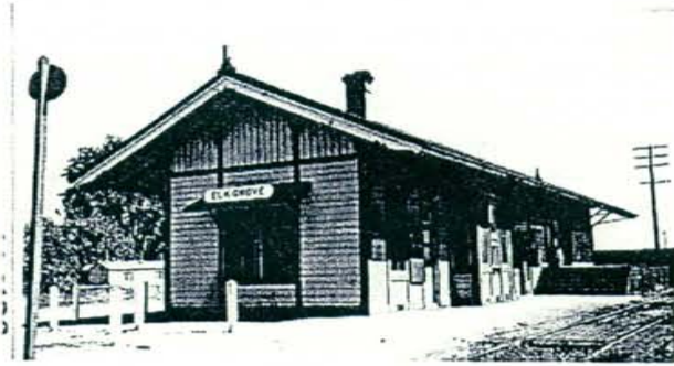
Southern Pacific Railroad Station, Elk Grove, 1940.